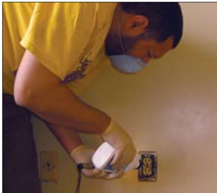
Tempo 1% dust was applied to several areas, including electric outlets.

Despite thoroughness during the treatments, we were not able to eradicate the bed bugs from two heavily infested apartments after eight weeks. One apartment received treatment at zero-, two-, six-, and eight-week intervals. The other apartment